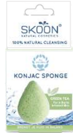
Konjac Sponge Green Tea

A deep, 100% natural cleansing for the normal skin type using just water. Gently removes dead skin cells, water-based make-up, and impurities.