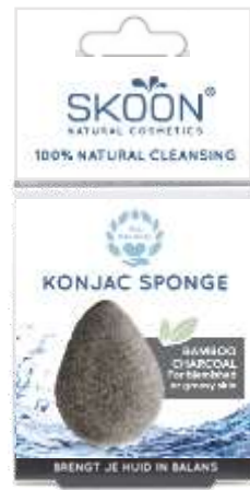
Konjac Sponge Bamboo Charcoal

A deep, 100% natural cleansing for the blemished and/or greasy skin type using just water. Gently removes dead skin cells, water-based make-up, and impurities.