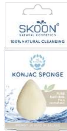
Konjac Sponge Pure Natural

A deep, 100% natural cleansing for the blemished and/or greasy skin type using just water. Gently removes dead skin cells, water-based make-up, and impurities.